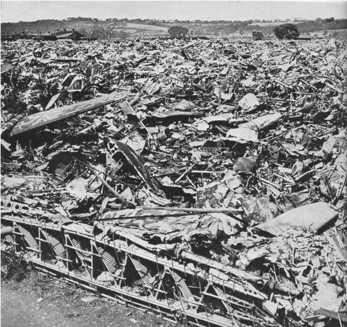
A small part of the dump looking towards HorSPATH in abt 1944

Some 70 years ago, the land now occupied by BMW and some of the adjoining local farmland now threatened by developers for a new housing estate, was the site of the largest crashed aircraft dump in southern England during WW2 :-